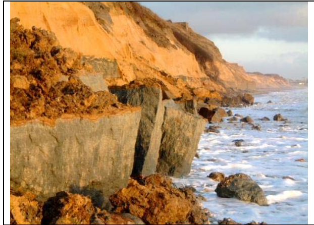
High Tide at Pakefield, courtesy of UK Fossils Network

Late in 2001, they hit the jackpot: during an excavation, they found a small flint flake. To the uninitiated, it's just a chip of stone, the sort of thing you might prise out of your sandal.